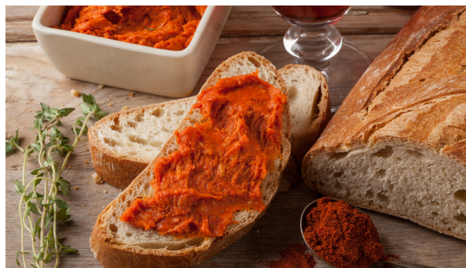
GALA VINEYARD DINNER An enchanting dinner in a vineyard setting.

An unforgettable dinner filled with all manner of sensory experiences. Set in the charming surroundings of a wine estate near Cosenza, this exclusive gala offers you the chance to savour delightful traditional cuisine and magnificent local wines, with the finest whites and reds. A romantic evening designed to be "sipped" slowly, amid country-chic atmospheres that will take you back in time.